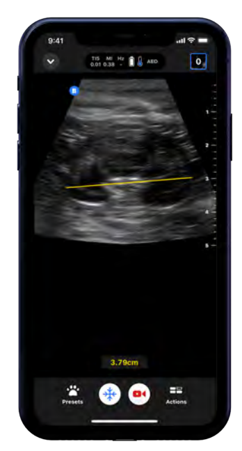
Abdominal small-animal kidney measurement

Rule out cortical deviations with sharper bone surface imaging.